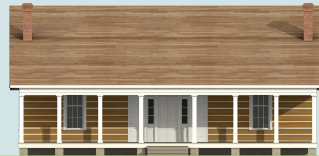
Otey - Marr - Argo - Dogwood Hill