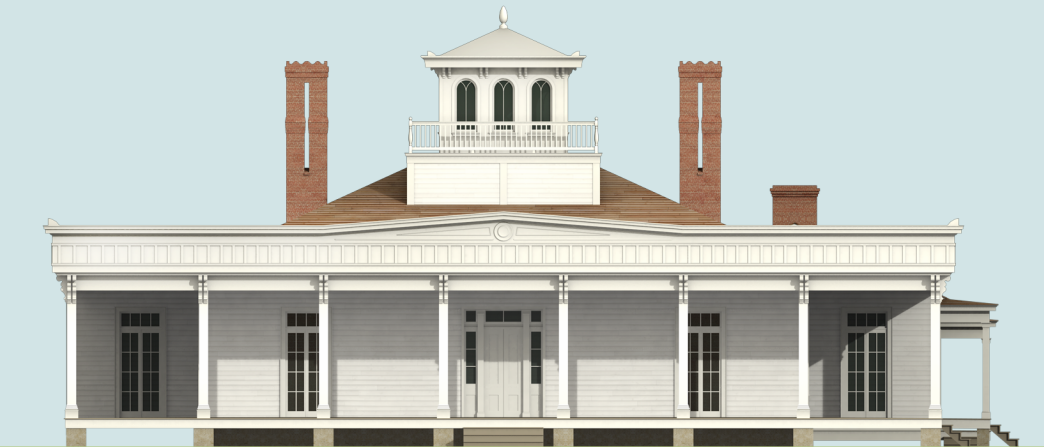
Morgan Lodge - Clark - Clark - Parmly - Hill Burned circa 1933