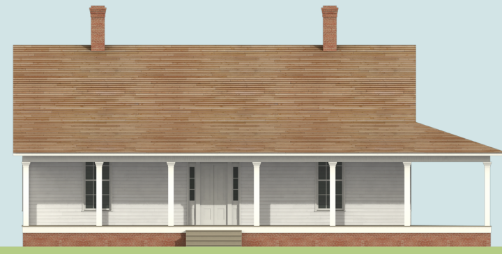
Armfield - Glasgow