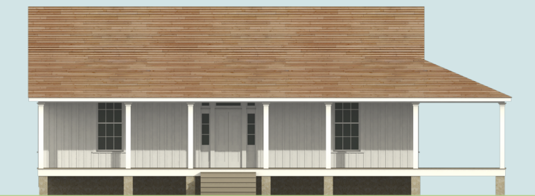
Garrett - Murfree - Crag Wyld - Lover's Leap Burned before 1909