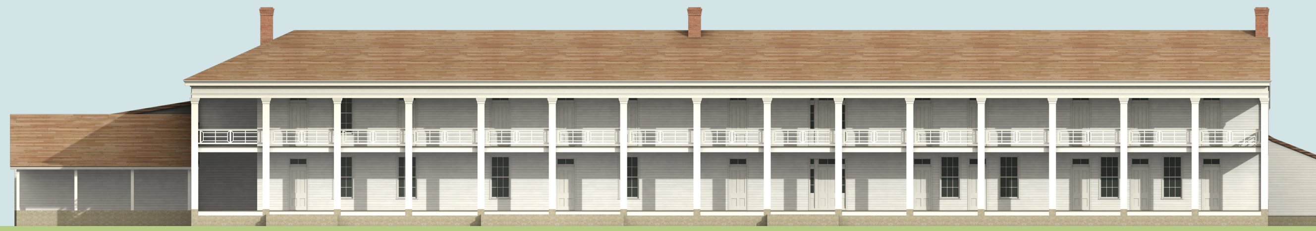
Beersheba Springs Hotel