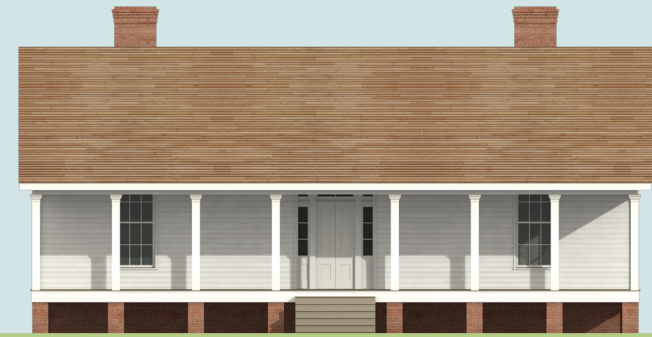
Bass - Turner - Summer Rest - Fassnacht Remodeled substantially circa 1890