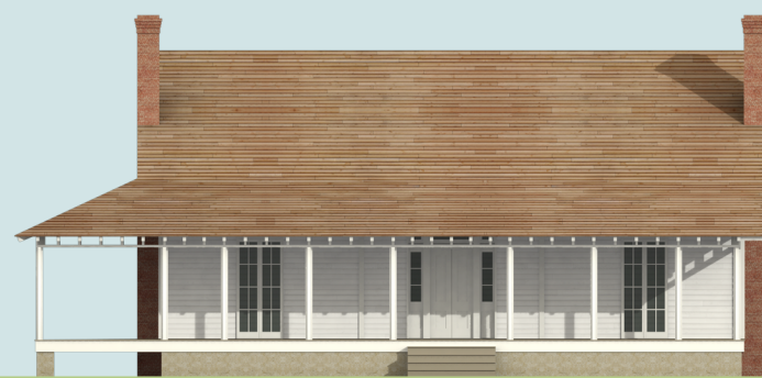
Dahlgren - Thompson - Nanhaven Burned 2015