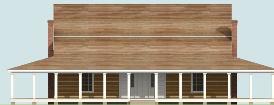
Polk - Swallow's Rest - Howell