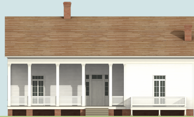
Murfree - Merritt - White House