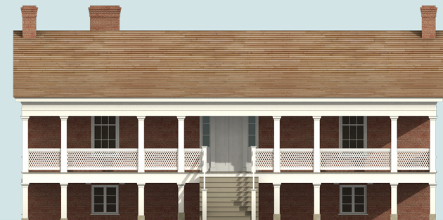
Harding - Mitchell - Drumright - Papel