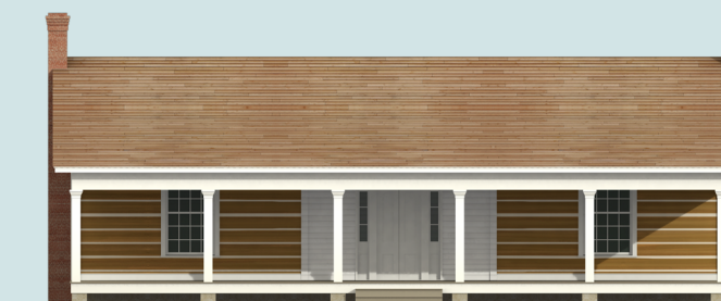
Cockrill (1860) - McGee - Mayhew