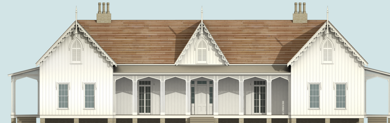
Williams - Freeland - Black - Hemlock Hall