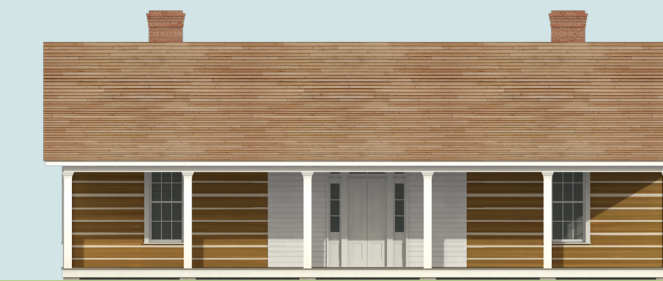
Cockrill (1858) - Hege - Beersheba Inn Remodeled substantially circa 1990