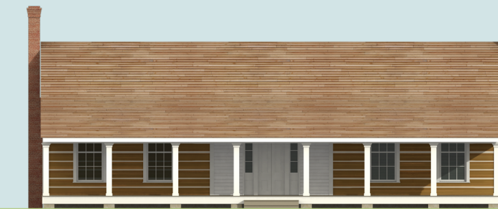
Graves - Eve - Stansbury