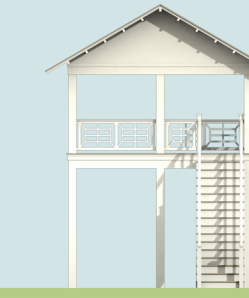
Chalybeate Springhouse Demolished early 20th century